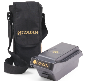
Battery & battery travel bag standard