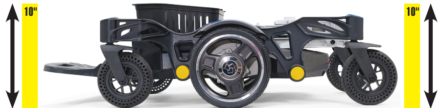
Folds to only 10" high for storing in small spaces

Literature is current at time of printing. Golden Technologies reserves the right to make changes to the product or literature at any time.